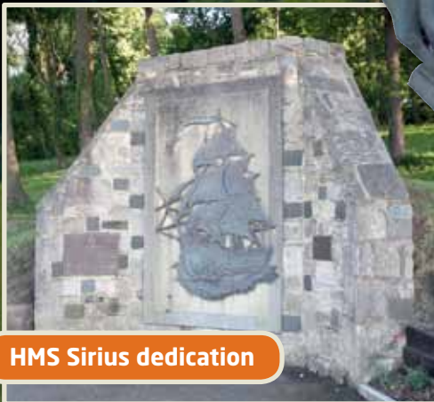
HMS Sirius dedication