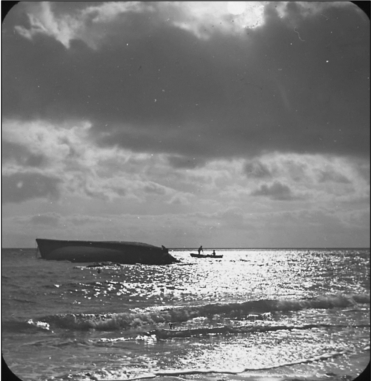
After the Storm, Sandown. A view from the beach of the hull of a boat upturned in the water. To the right of the hull is a small boat with two people aboard. The J.B. Williamson Collection. IWCMS.2009.23

The J.B. Williamson Collection is a collection of images of Island shipwrecks and lifeboats that was donated to the Isle of Wight Heritage Service.