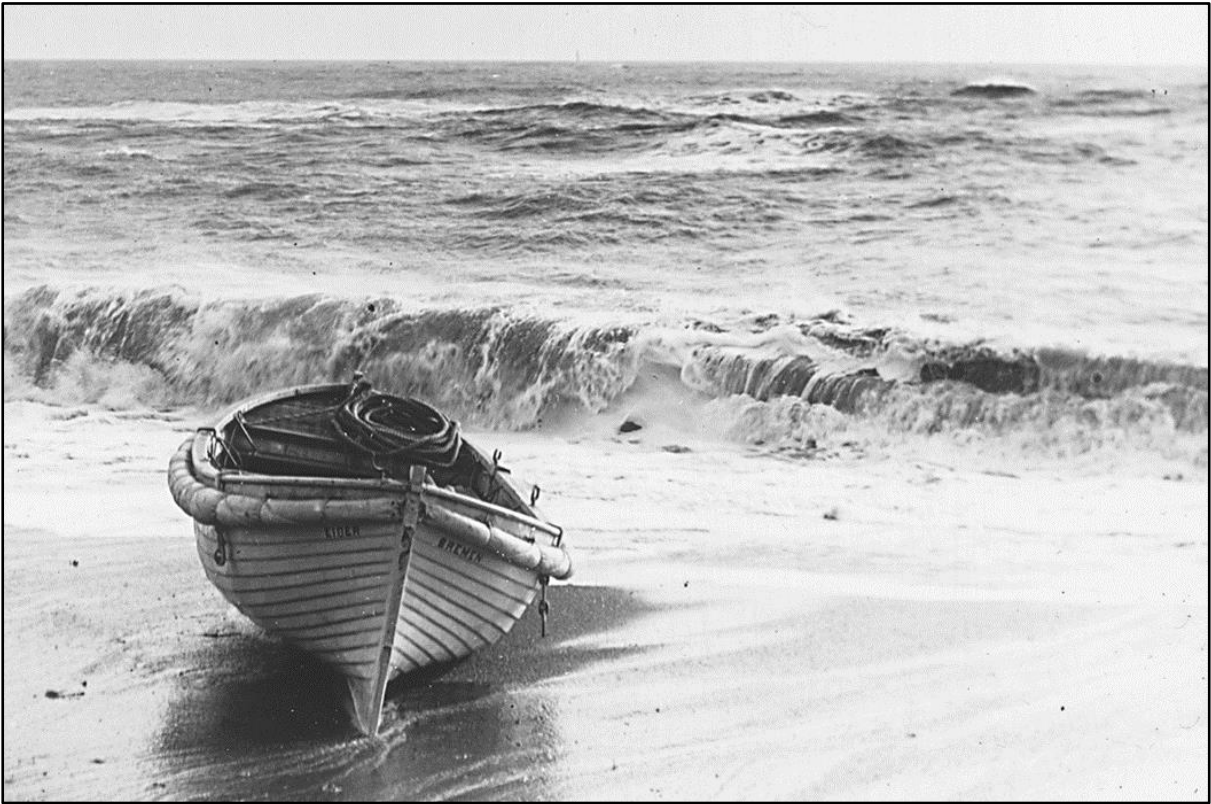
The Wreck of the Eider - the boat of the Eider. A rowing boat from the Eider on the shore with a rough sea behind.