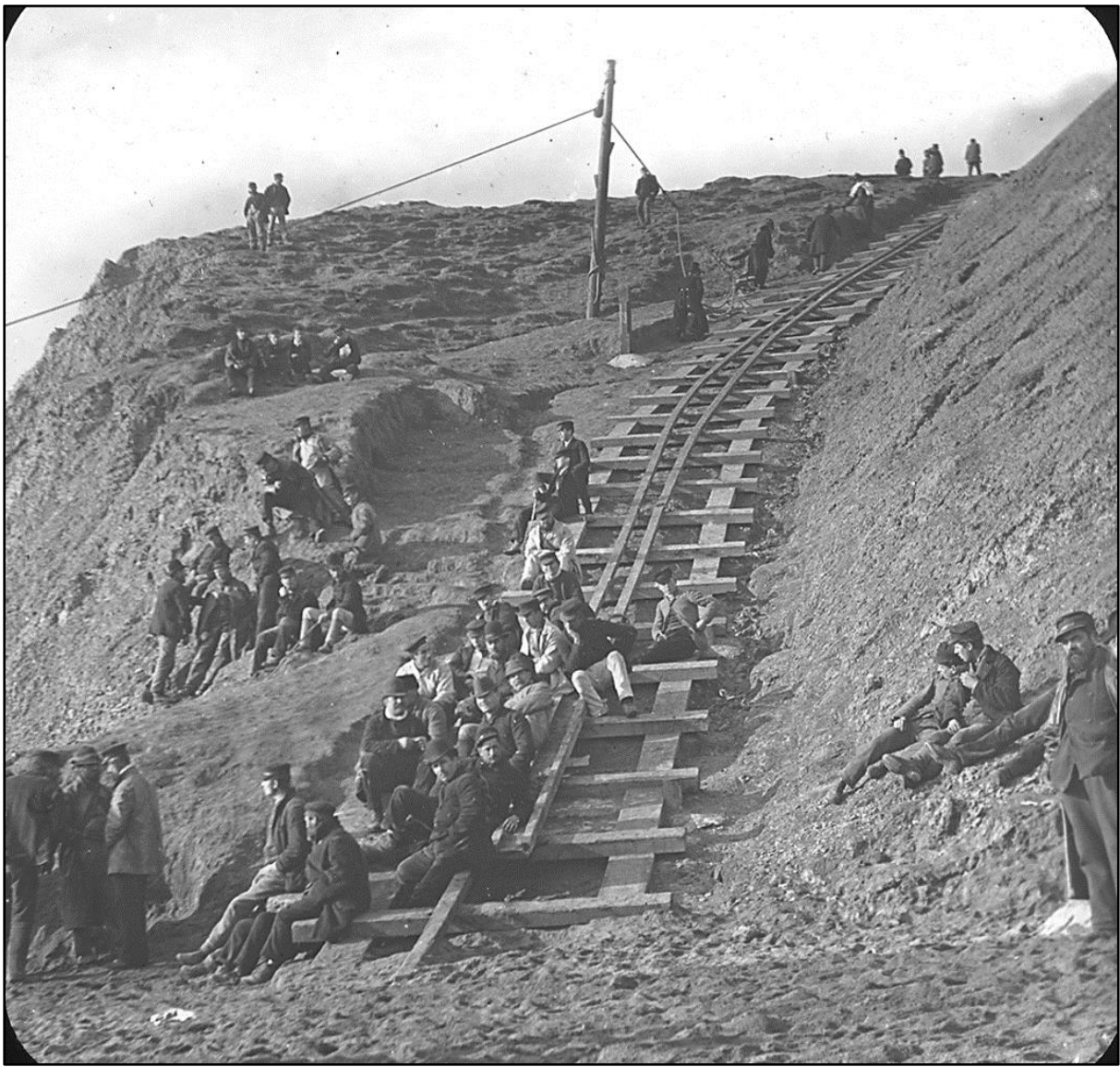
The Wreck of the Eider - lifeboat slipway at .... Looking up the slipway built to get the lifeboat from the cliff onto the beach.