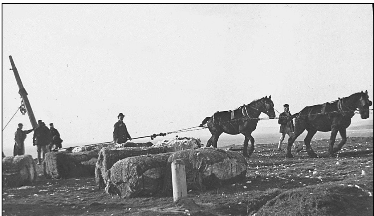
Eider. A team of cart horses with a hoist are lifting large cotton bales from the Eider to the top of the cliff during salvage operations.