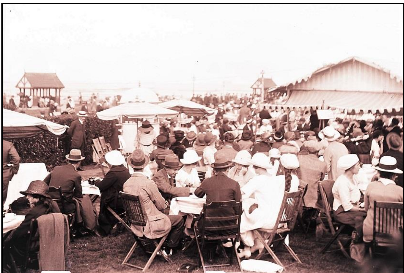
Ryde Esplanade. One of the deckchairs has 'Borough of Ryde' written on the reverse. Circa. 1920s.