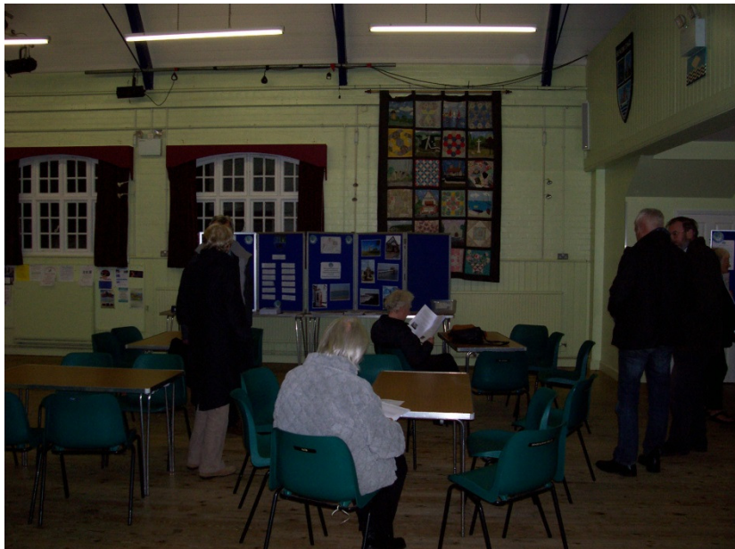
Consultation event held on 7 th November 2013

The working group firmly believe that the actions taken, and outlined above, demonstrate that the issued documentation clearly represents the stated views of the clear majority of Bembridge community.