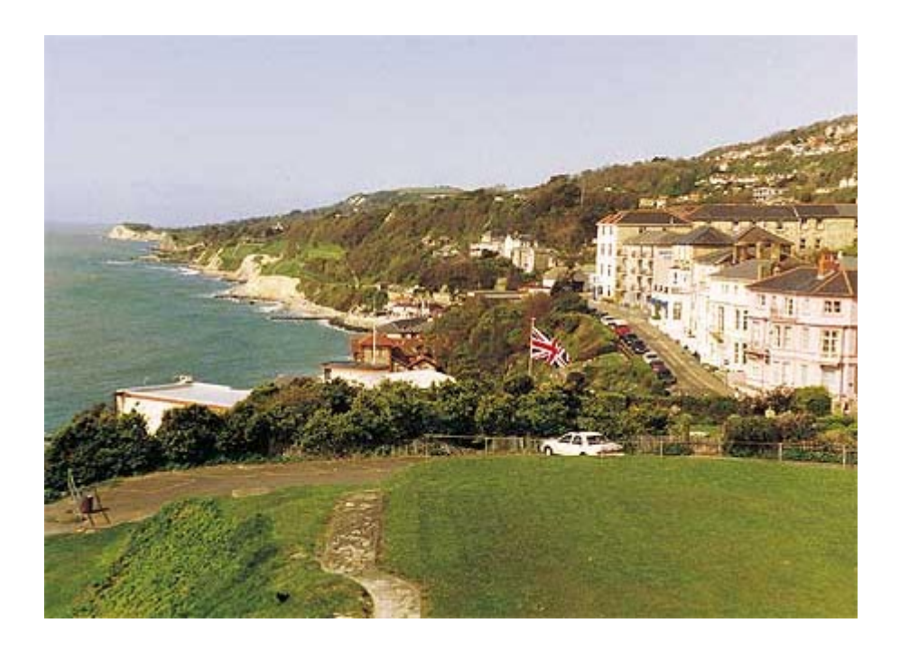
Plate G4 Ventnor town looking westwards, Isle of Wight, UK