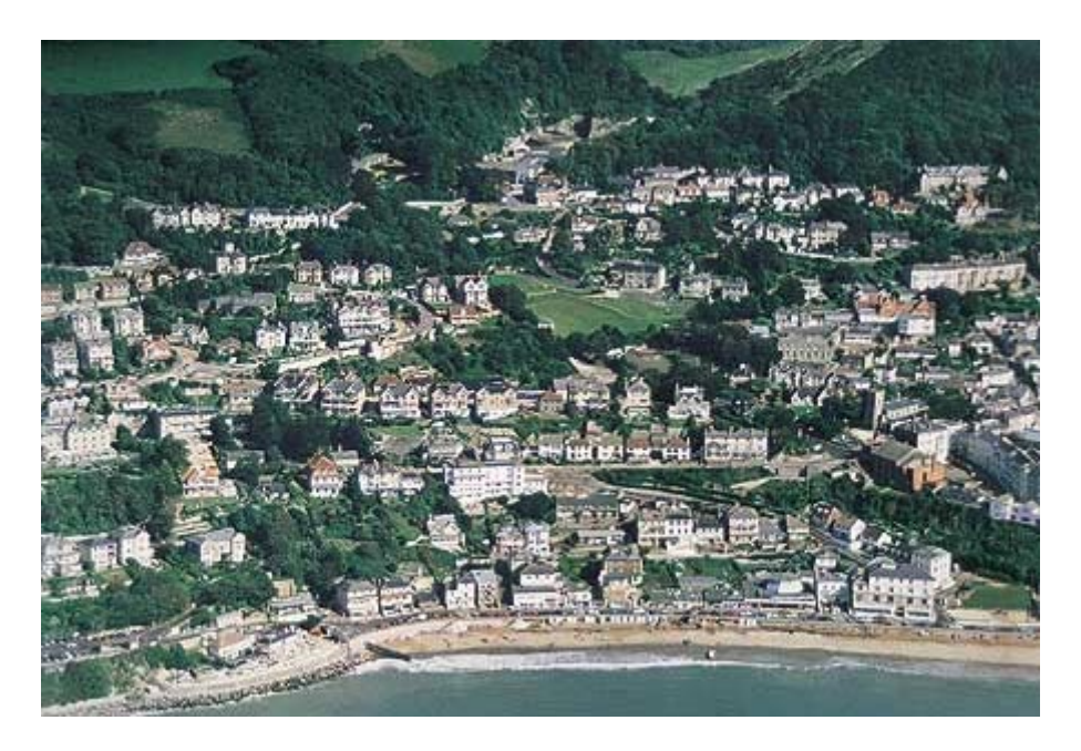
Plate G4a Ventnor town from the sea