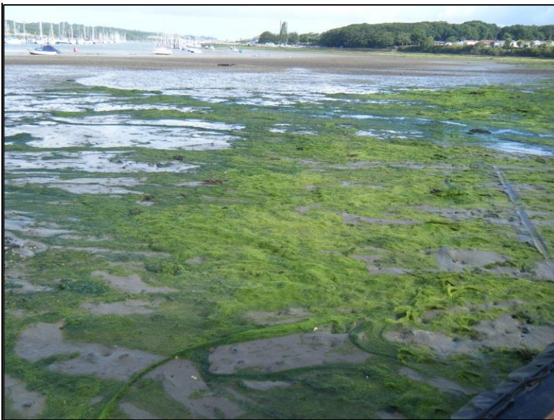
Figure 1 Green macroalgae in the Medina estuary

This problem isn't confined to the Medina estuary; it occurs in many sheltered, muddy estuaries within the Solent area and elsewhere where conditions are suitable. It is referred to as 'eutrophication' which is the process by which nutrient enrichment causes excessive algal growth which then causes ecological disturbance. In most Solent estuaries, the problem nutrient is usually nitrate (a type of nitrogen) whereas in freshwaters the problem nutrient is usually phosphate (a type of phosphorus). In the Medina estuary both nitrate and phosphate may contribute to excessive algal growth.