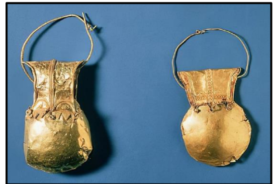
Two gold bullae from the buried city of Herculaneum. 1st century AD.

This activity will show you how to make your own bulla. You can use your bulla as a purse to keep safe your special coins.