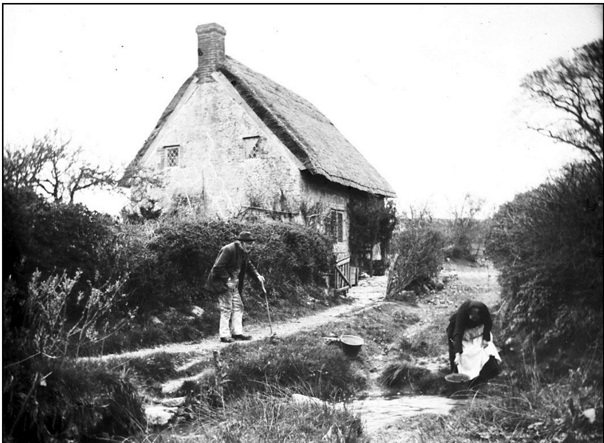
Old Friends and Scenes. An Island cottage scene. An elderly woman gathers water from a stream with a pail as an elderly man looks on. Circa. 1890-1914