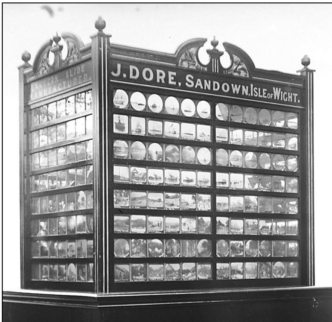
The lantern slide display case that was exhibited at the World's Fair, Chicago in 1893 (detail showing the slides).