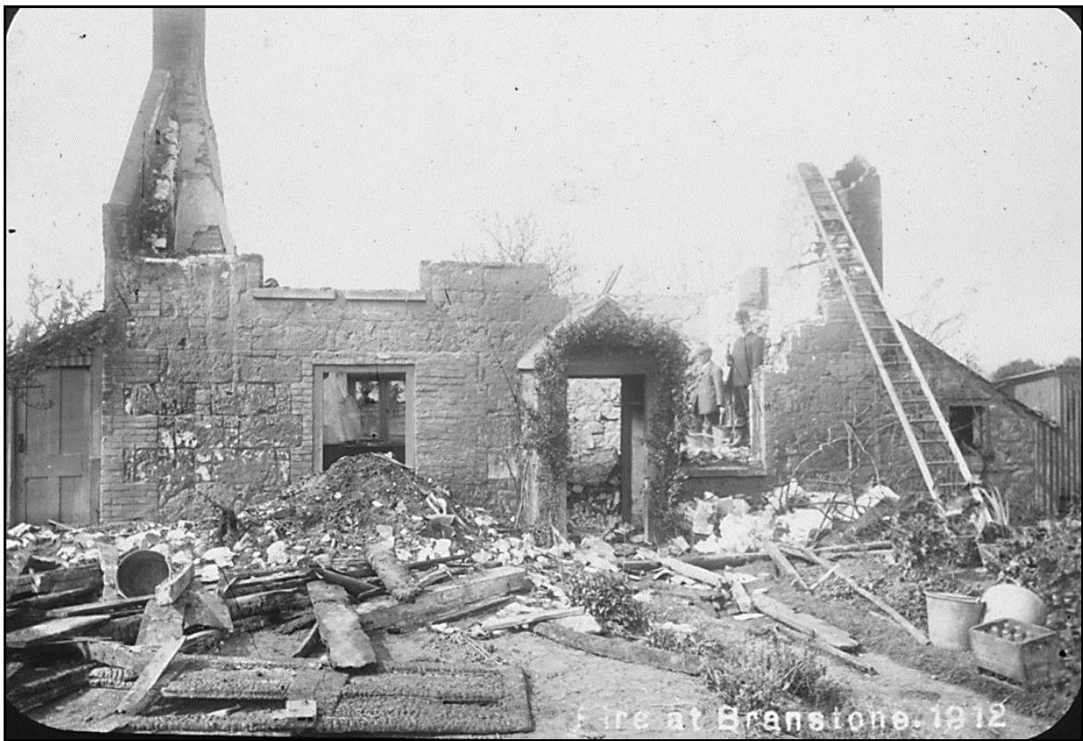
Fire at Branstone 1912. The remains of a building after a fire at Branstone. Two men stand within the ruins. 1912