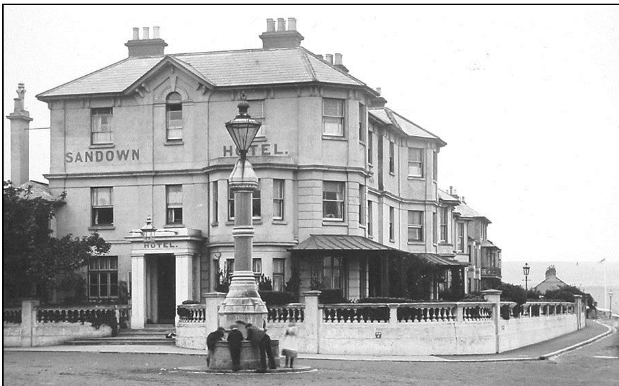
The Sandown Hotel. Children can be seen at the water fountain. Circa. 1890-1914