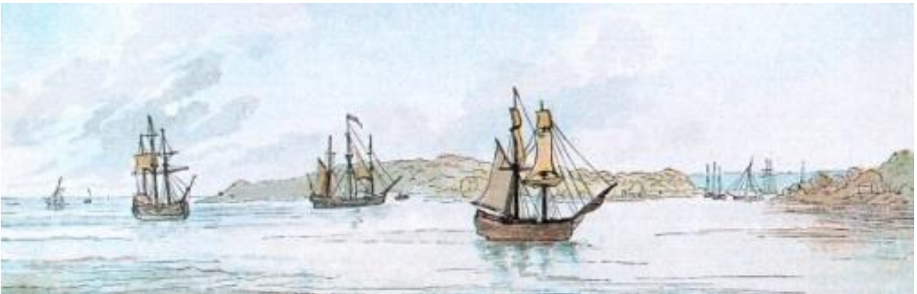
A general view of the Isle of Wight, looking from the extreme western point.