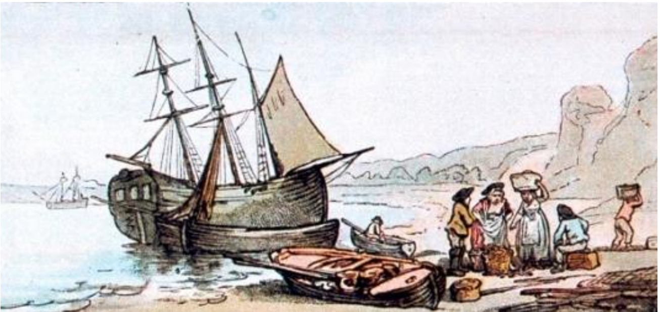
Cowes harbour, in the Isle of Wight (detail).