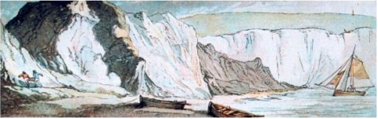
Six miles from Yarmouth - Alum Bay, the famous and brilliant coloured sands running down the rocks forms the most beautiful effects.