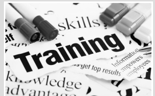
Adult & Children's Social Care