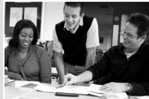
Adult Community Learning