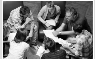
Schools & Learning